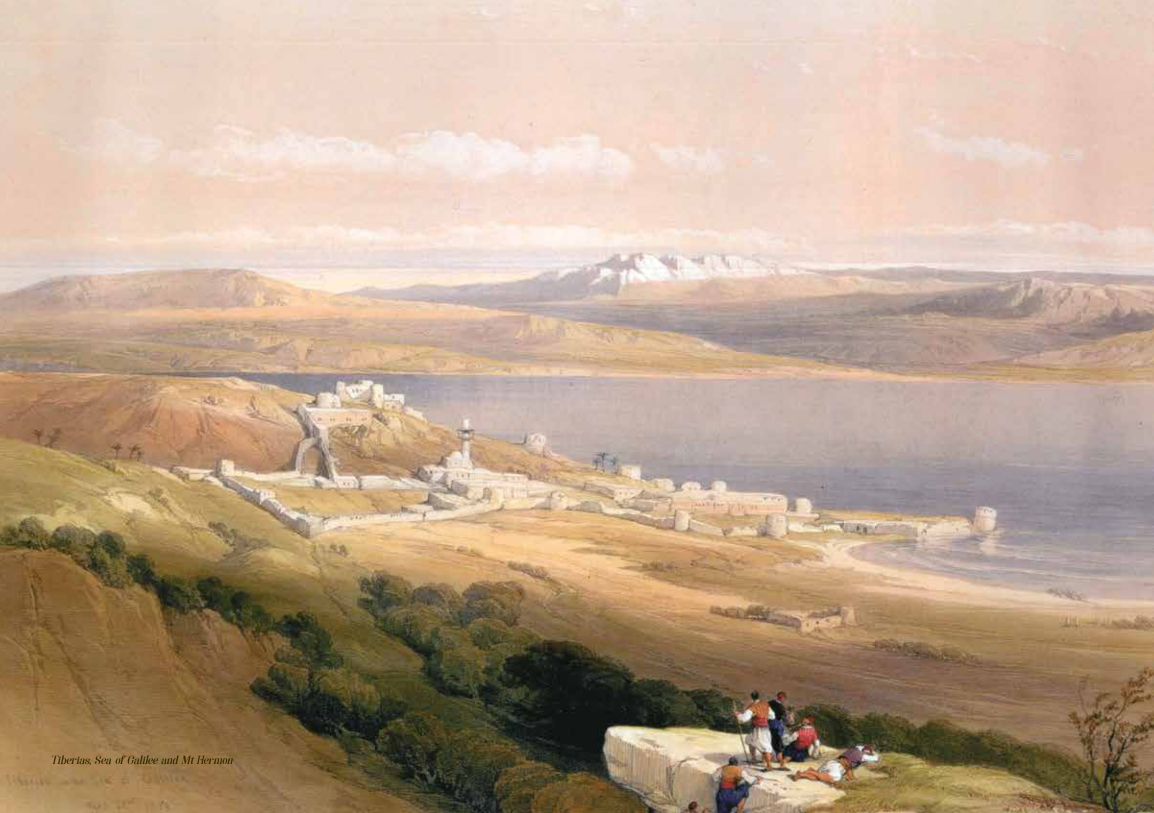
Tiberias, Sea of Galilee and Mt Hermon