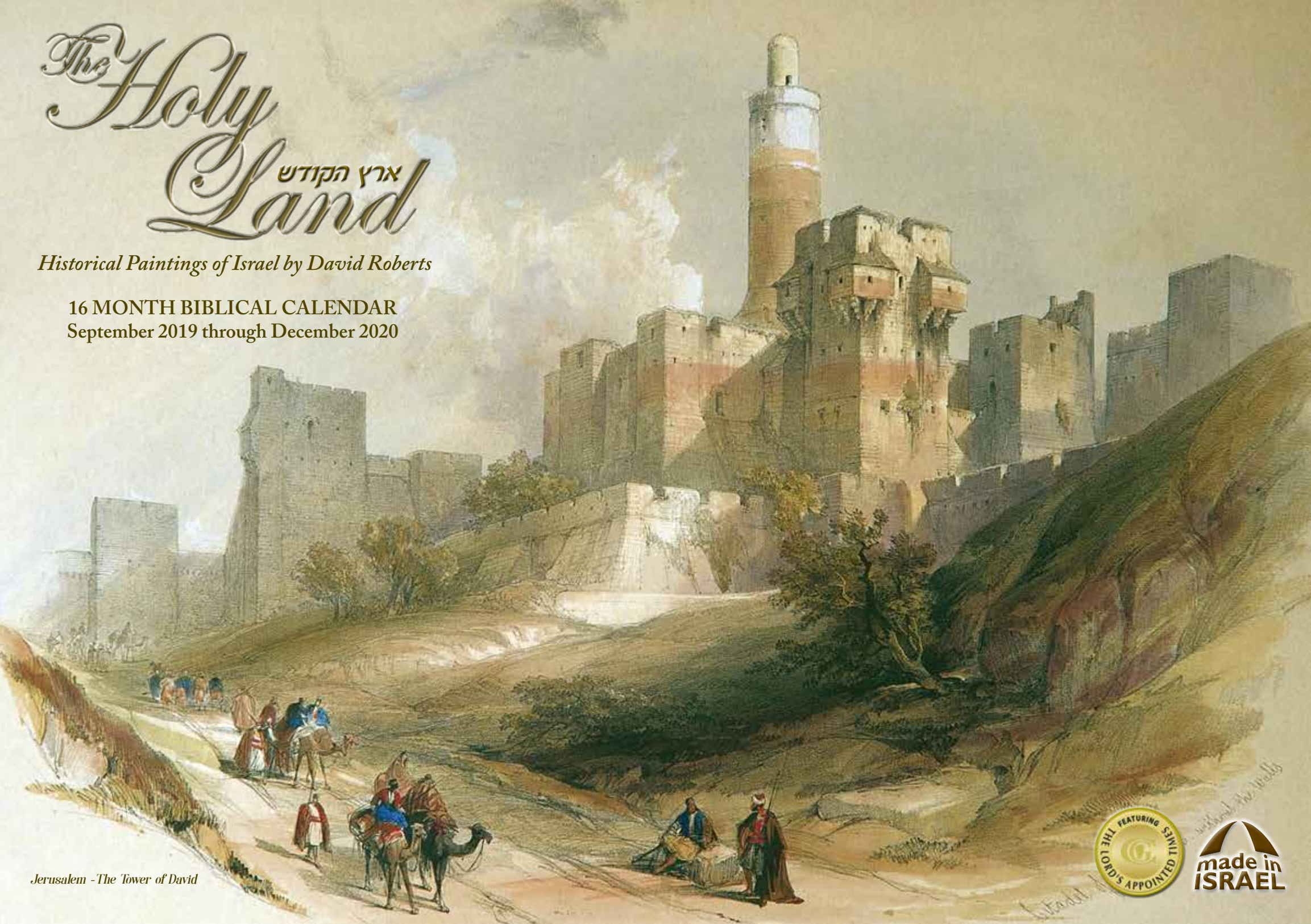
Jerusalem - The Tower of David

16 MONTH BIBLICAL CALENDAR September 2019 through December 2020